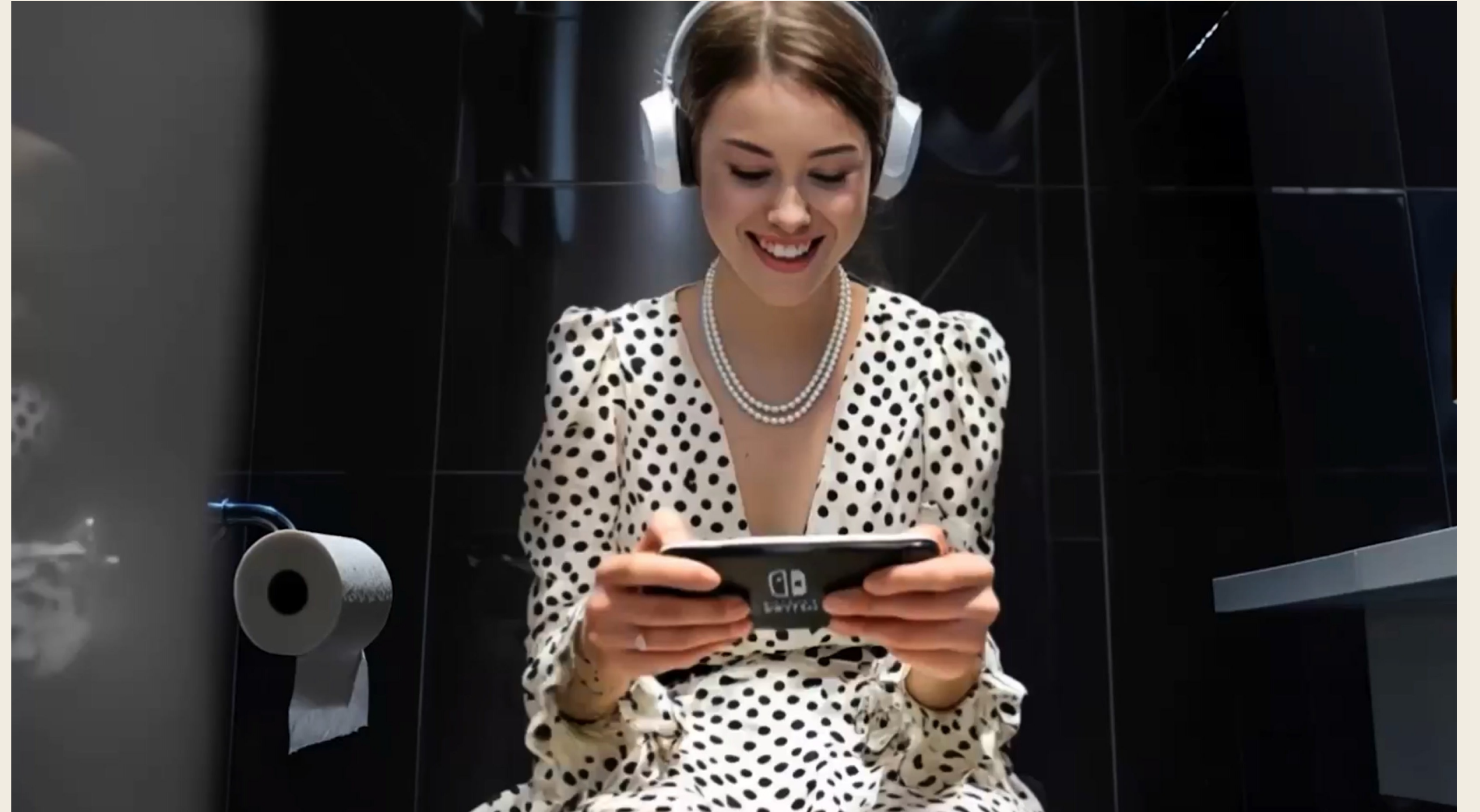
A N I M A T I C F R A M E

We treat AI as a directing tool, not a generator. Each frame is grounded in the brief, in the brand language, in the visual logic of the work.